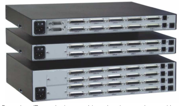
Rear view (Top unit shown with optional expansion card installed)

■ Phone: 281-933-7673 ■ E-mail: sales@rose.com ■