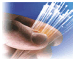
Extend your USB device up to 33,000 feet over industry standard fiber cable

The host computer must be equipped with an EHCI (USB 2.0) host controller. OHCI/UHCI (USB 1.1) host controllers are not supported.