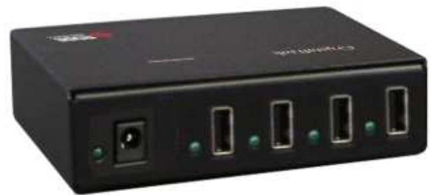
Rear view 4-port

■ Phone: 281-933-7673 ■ E-mail: sales@rose.com ■